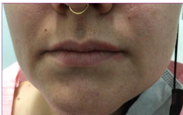
Figure 1. Angular cheilitis and dry lips at the periphery with fissures and erythema involving the bilateral superior cutaneous lip and apical triangles.

present for one and a half years. She reports a significant history of acne, chronic back pain, scoliosis and an allergy to morphine. Her medications include buspirone, cannabidiol, gabapentin, propranolol, prozac, trazodone, xanax and omeprazole. Physical examination demonstrated angular cheilitis and dry lips at the periphery with fissures and erythema involving the bilateral superior cutaneous lip and apical triangles ( Figure 1 ). A serum vitamin, nicotinamide and zinc panel were ordered to rule out any vitamin deficiencies. Zinc, nicotinamide and vitamin B1, B2, B3, B9 and B12 levels were unremarkable. A trial of topical 2% ketoconazole cream and topical 0.05% desonide ointment were ordered.